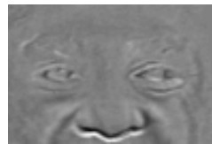
Figure 3: Difference images from the BBC data set. Row 1: Genuine, Rows 2 and 3: Support Vectors, Row 4: Posed