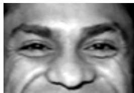
Figure 2: Examples from the BBC data set. Row 1: Genuine, Row 2: Posed.